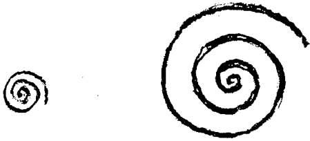
Fig. 1 is a clock spring wound up tight, to exemplify concentration .