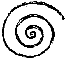
Fig. 2. Same spring unwound to exemplify decentration .