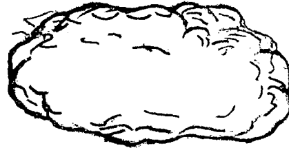
Fig. 3 & 4 represents water concentrated into a drop and decentrated into vapor.